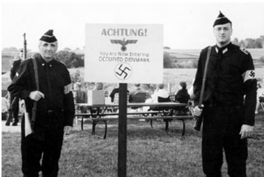
Unsmiling guards set the initial tone for the production.