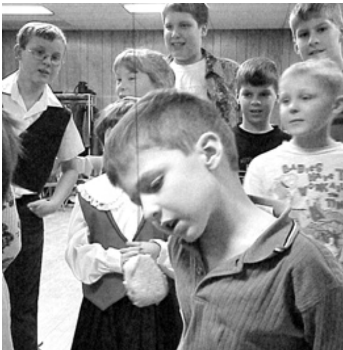
Bollers on a string provided a Danish version of bobbing for apples.