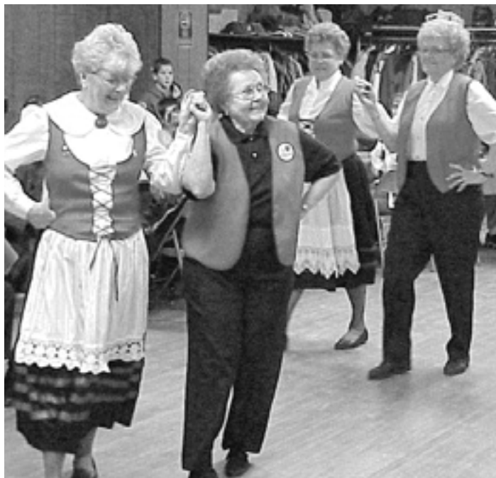
Folk dancing was an integral part of the evening’s fun.