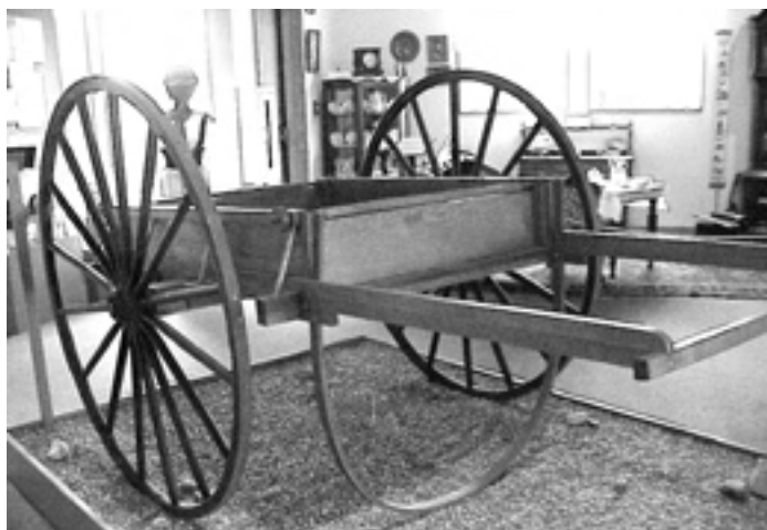
Handcart Replica, wood and metal, loaned by Cass County Mormon Trails Association, Inc.

plagues, congressional debates about Utah, and, even the Fourth of July. All this detail gave prospective emigrants great familiarity with the Utah Territory, perhaps more than with their own country.