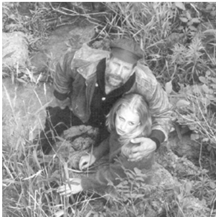
"Number the Stars" returns for another season at the Danish Immigrant Museum's outdoor theater.

In this stirring play, young Annemarie and Kirsti Johansen face soldiers, interrogations, fierce dogs, personal danger, the loss of loved ones and their own fears as they try to help their friend Ellen Rosen escape across the ocean to Sweden and safety. Courage, faith, ingenuity, and even fledgling acting skills eventually win the day. All the drama, pathos, adventure, terror, and humor that have made Number the Stars a National Best seller (and winner of the Newbery Award and the American Library Association Book of the Year Award)