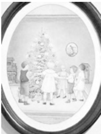
Lorraine dances around the Christmas tree with her two sisters and male cousins, 1985