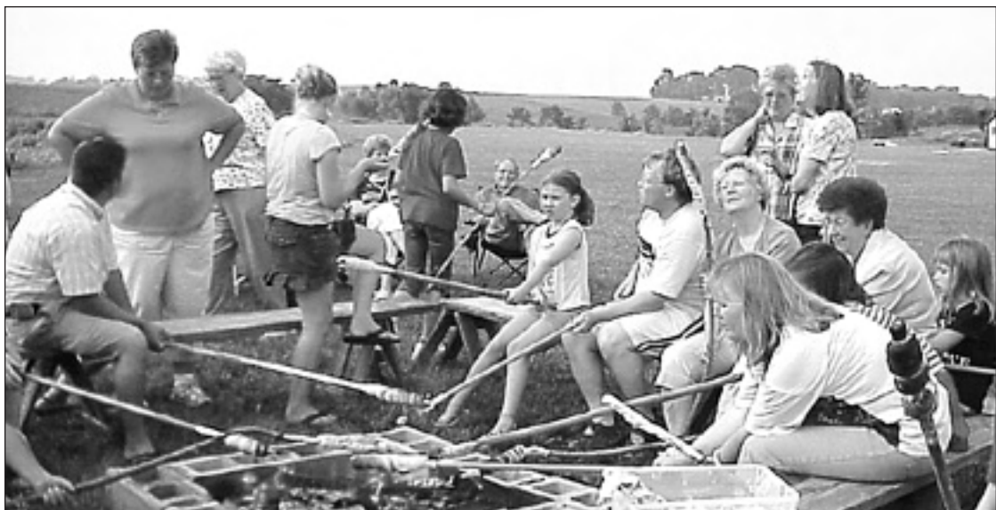
Children of all ages enjoy roasting snobrød.