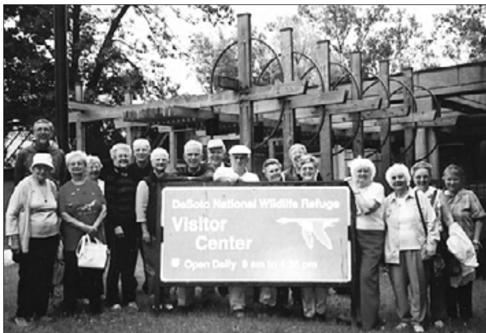
Danish Heritage Seminar participants visited the DeSoto Wildlife Refuge and heard about the Missouri River ecology and environment.