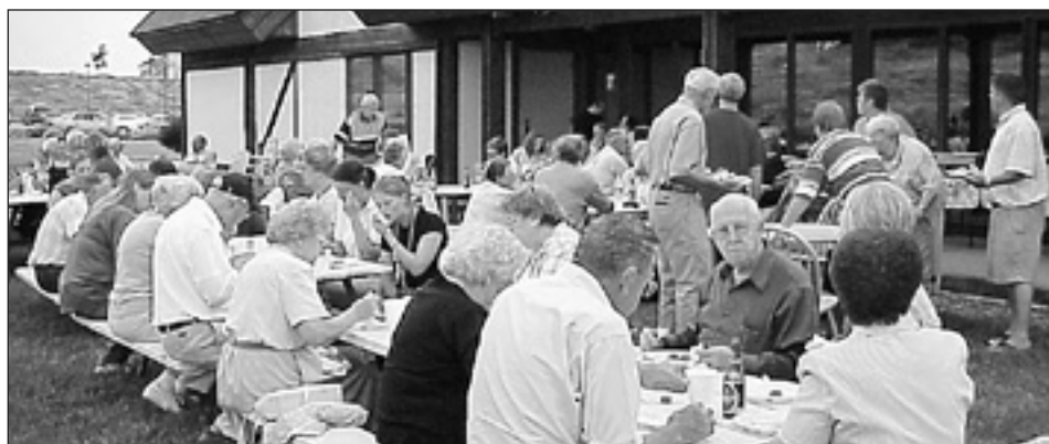
Visitors enjoy a picnic supper as they listen to old-time music.

The Elk Horn-Kimballton Danish Brotherhood Lodge No. 341, Rebild Society-Heartland Chapter and The Danish Immigrant Museum sponsored this annual event.