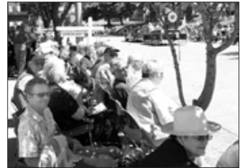
Members of the Federation of Danish Associations in Canada enjoy the Tivoli Fest parade.