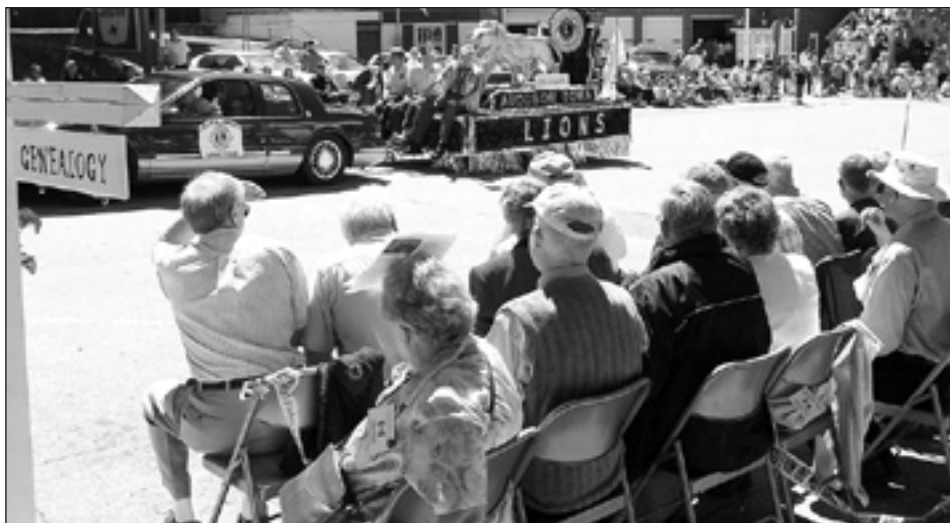
Members of the Federation of Danish Associations in Canada enjoy the Tivoli Fest parade.