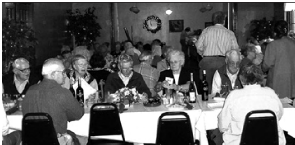
The Federation of Danish Associations in Canada annual dinner meeting was held at the Main Street Grill in Atlantic.