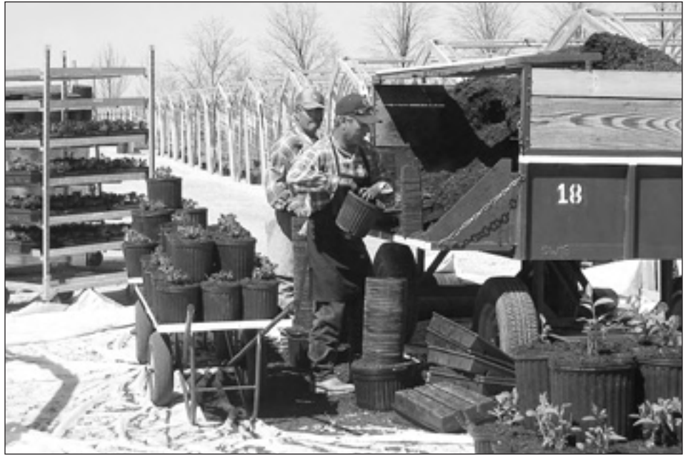
A team pots shrubs at the company’s Virgil, Illinois facility. Midwest Groundcovers employs hundreds of seasonal workers between March and October. Many are Mexican immigrants.

The work is seasonal in the nursery business. Often Mexican men travel to