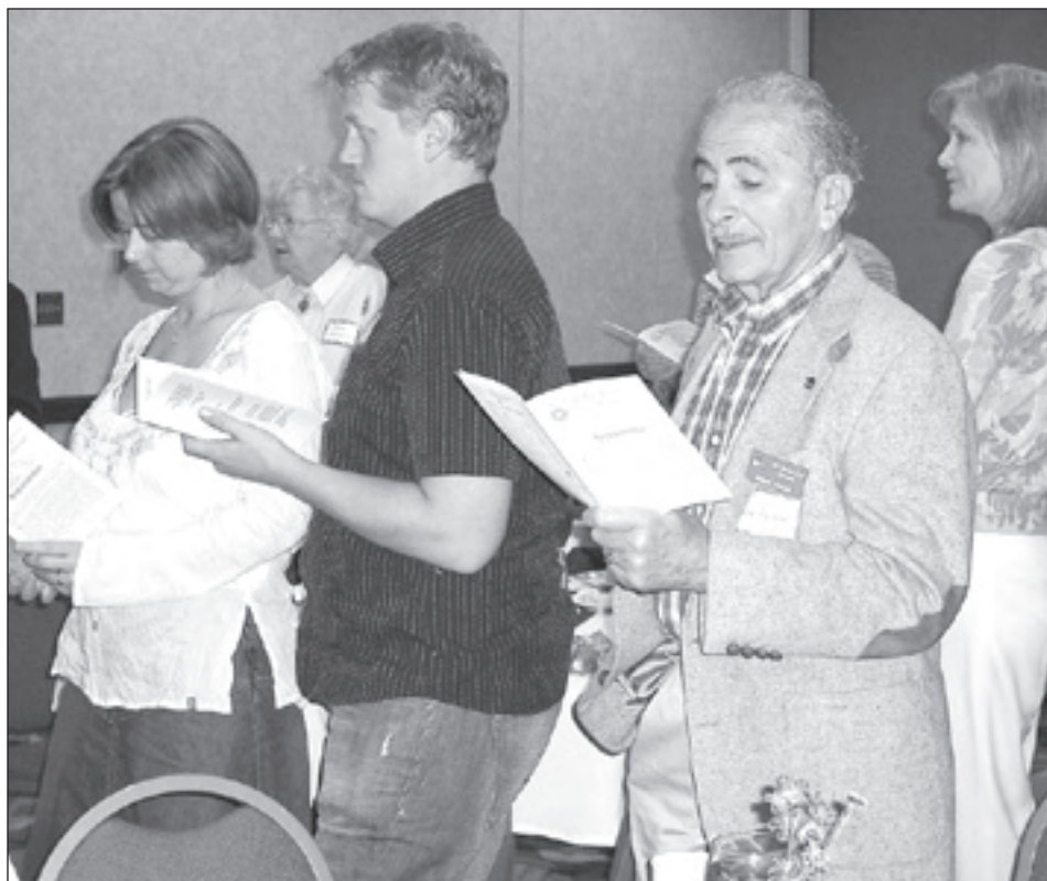
Luncheon guests at the Tampa Board meeting join in singing the U.S. and Danish national anthems