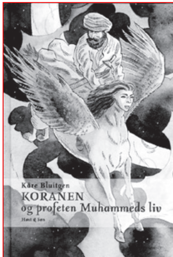
Kåre Bluitgen's book that began the controversy.

February 19, 2006: "Why I Published Those Cartoons," an editorial by Flemming Rose, appears in Jyllands-Posten (available at www.jp.dk ).