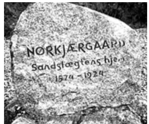
Memorial stone located at the entrance to Norkærgaard.