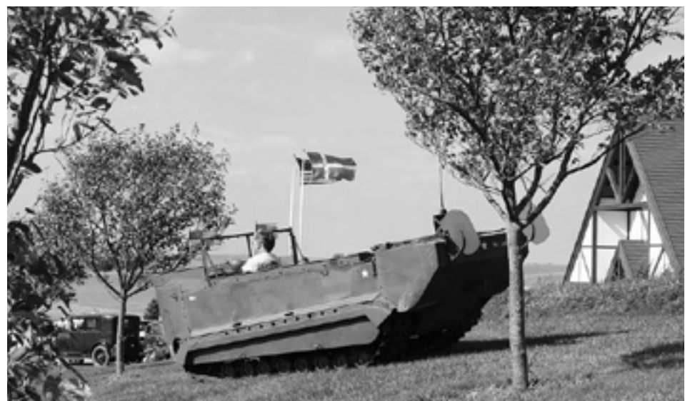
A World War II Weasel creeps over the grounds of The Danish Immigrant Museum during the Liberty Car Show.