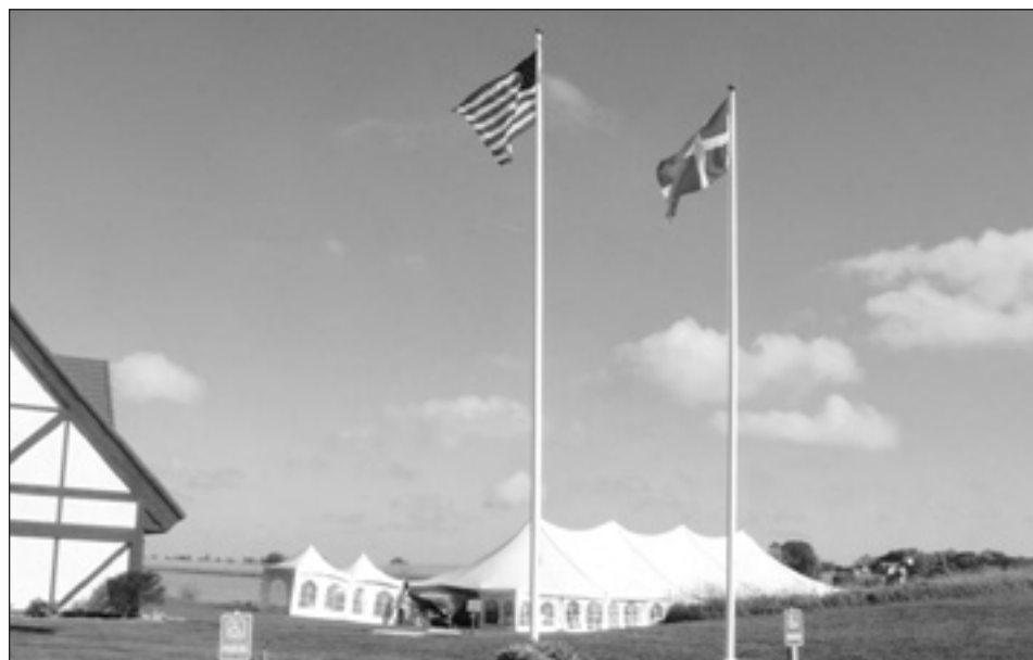
The luncheon was held in tents on museum grounds.