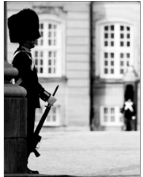
The Royal Danish Guard was founded in 1658 by King Frederik III.

Today the king's officials do not select the guards; instead, the guards sign up to perform their national service within the Danish Royal Guard. Nonetheless, the guard still recruits men and women with a certain character or at least a special eagerness to be a part of the unit. While ordinary military service lasts four months, soldiers in the guard must serve for eight months. Being a guard is somewhat a matter of patriotic pride; this is also indicated by the official