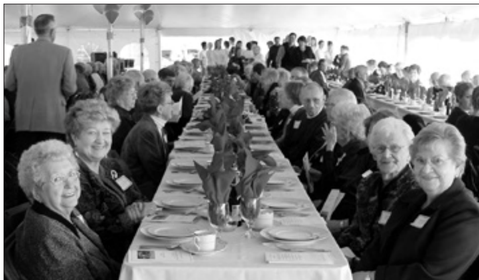
Former and current board members, museum members, volunteers, community members, staff and honored guests gathered to celebrate the museum's 25th anniversary.