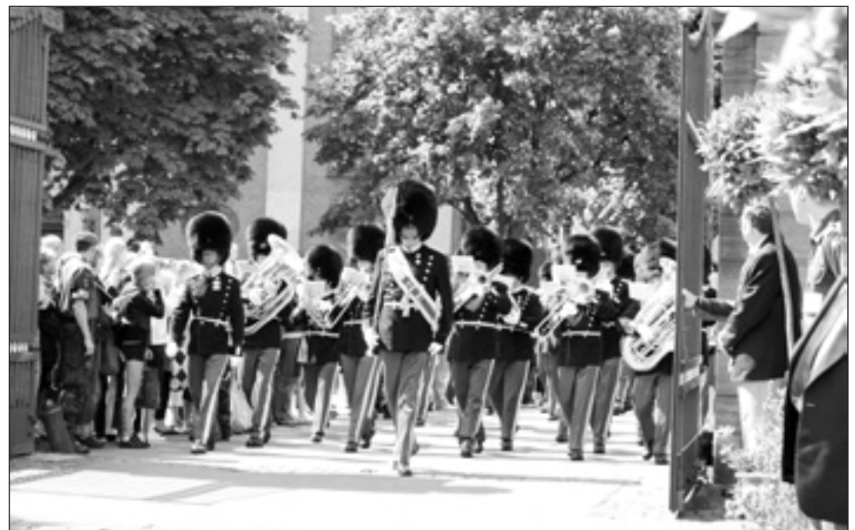
Royal Danish Guards march through Copenhagen during this summer's 350th anniversary celebration.

When the Danish Royal Guard celebrated their 350th anniversary this summer, it was, therefore, also a celebration of a national history. History, roots and traditions can build up national identities and that is exactly what the Royal Danish Guard symbolizes.