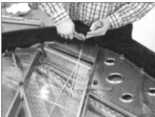
Victor Borge's first piano being restrung with new strings, tuning pins, and felts.