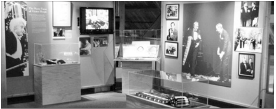
Victor Borge: A Centennial Celebration is on display at the museum until March 8, 2010.