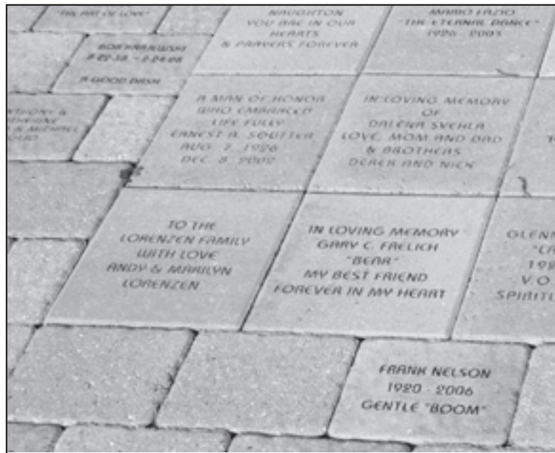
Examples of the two smaller sizes of bricks for the Jens Jensen Heritage Path