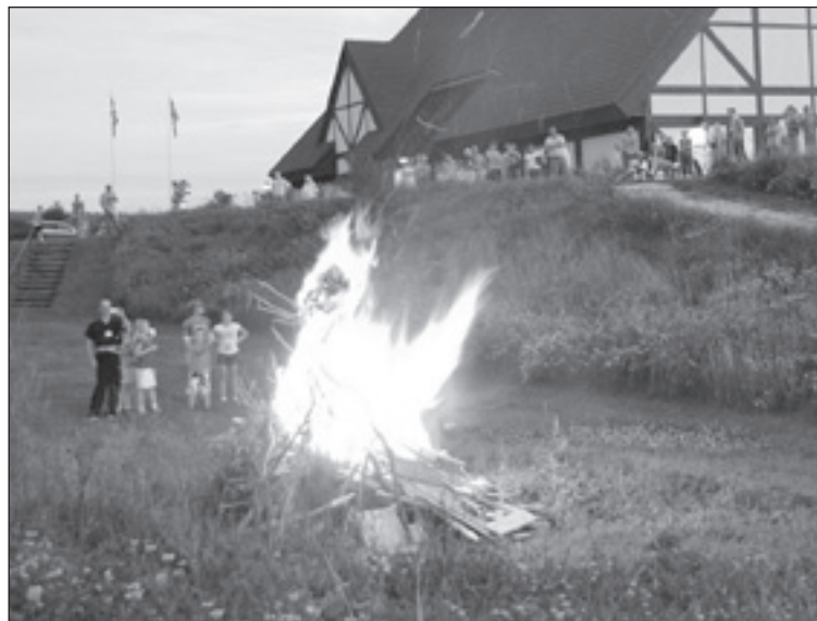
The Sankt Hans Aften bonfire envelopes the witch.