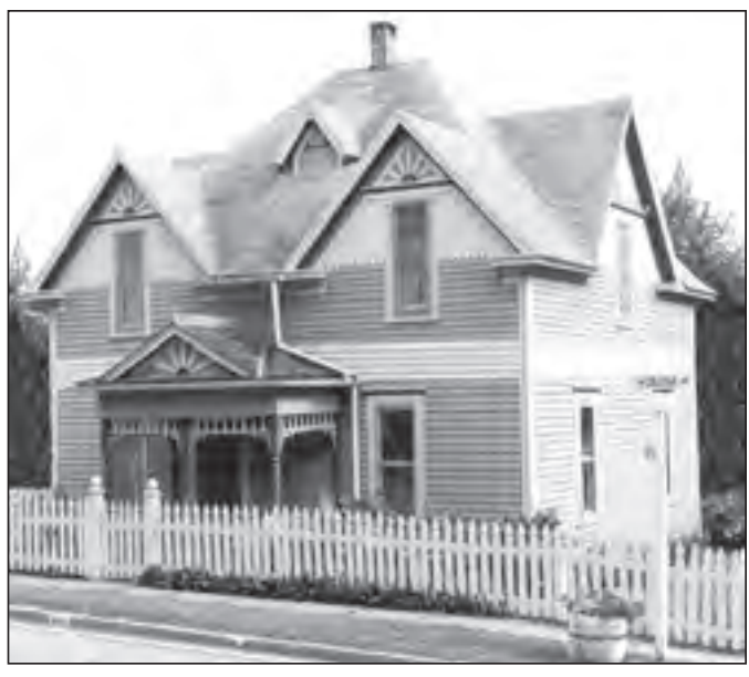
Bedstemor's House is open daily, 1 to 4 p.m., until mid-September.

Bedstemor's House is now open to visitors every afternoon. Owned and operated by The Danish Immigrant Museum, Bedstemor's House is a historic house restored to its original 1908 appearance. Bedstemor is the Danish word for "grandmother," and the house is furnished in the style of a Danish American grandmother from a century ago.