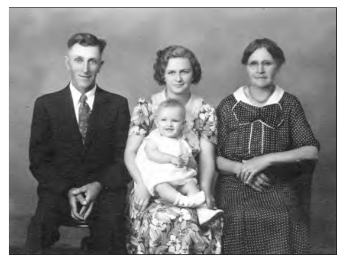
The summer FHGC photograph exhibit, "G is for Generations," features several dozen images of 3-, 4-, and 5-generations of Danish immigrant families.