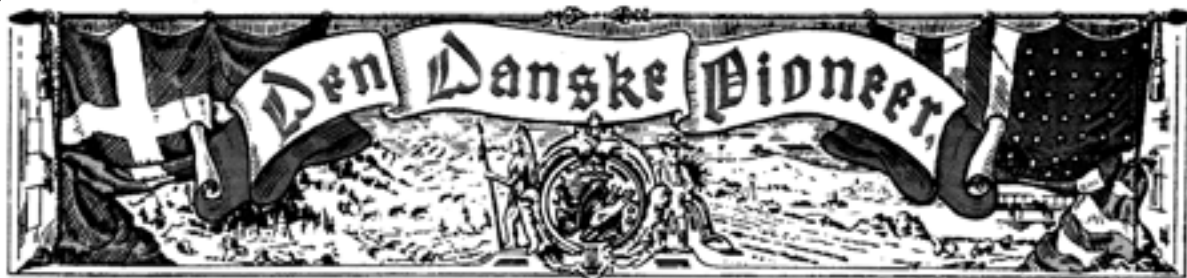
Masthead of the Danish newspaper, Den Danske Pioneer.