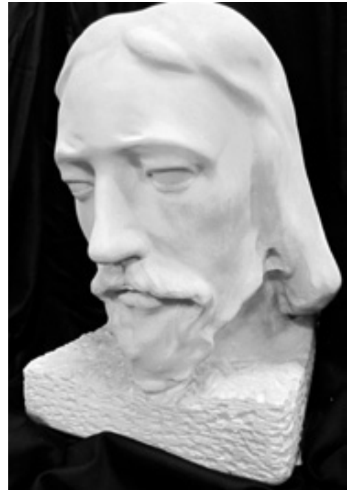
Jesus the Light of the World by Gutzon Borglum

Borglum's Jesus the Light of the World is a wonderful addition to a growing art collection here at The Danish Immigrant Museum. We look forward to sharing this beautiful sculpture with the public.