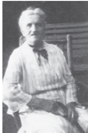
The only clue family in Denmark had was this photo with "Our dear Mother, 1845-1924" written on the back.