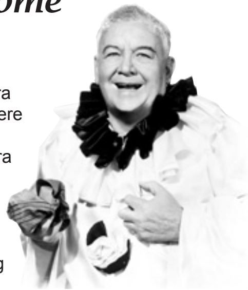
Melchior in the opera Pagliacci.

One of the most famous tenors in the world of opera was Lauritz Melchior. Born in Denmark in 1890, where he debuted with the Royal Danish Opera in 1913, Melchior went on to perform with all the leading opera companies in the western world. When the Nazis came to power, he refused to sing in Germany and ultimately immigrated to the United States where he later became a citizen. He is best remembered for being a member of the Metropolitan Opera, appearing in more performances of Wagnerian operas than any other artist.