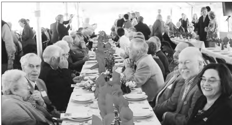
25th Anniversary guests enjoy a Rebild-style tent luncheon.