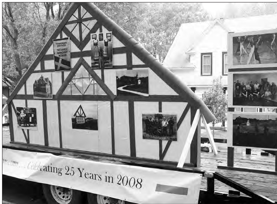
Tivoli Fest parade float celebrating the 25th anniversary of the Museum.