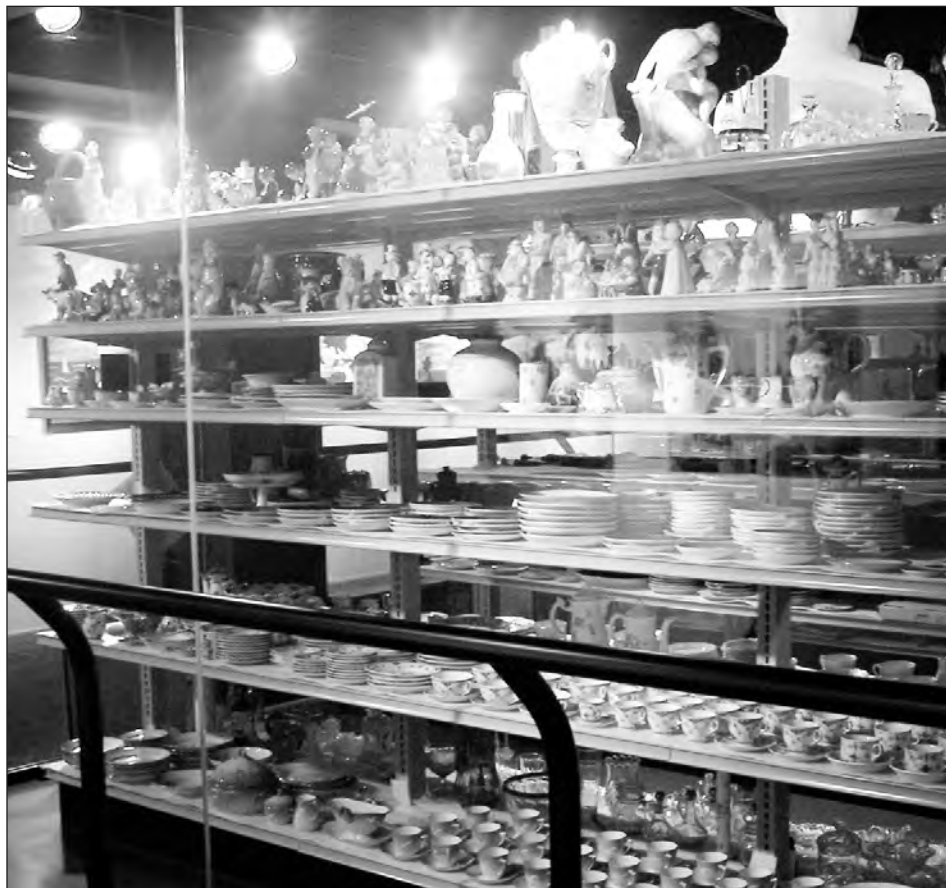
Treasured artifacts stored in climate controlled conditions can be viewed through the walls of glass in Visual Storage in the Lower Level.