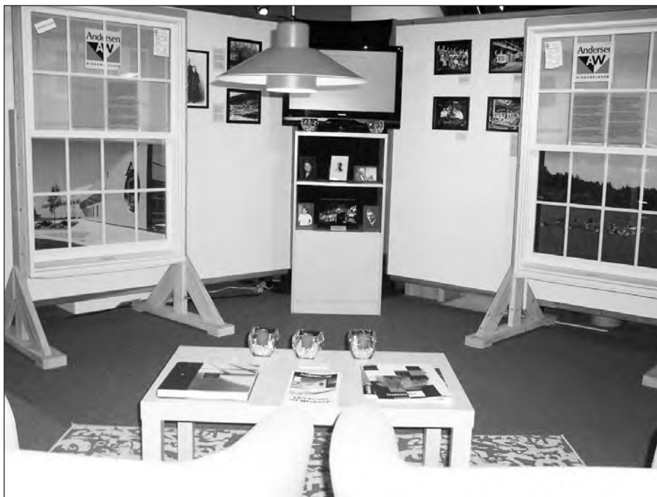
Museum's annual exhibit, "Across Oceans, Across Time, Across Generations" celebrates the Andersen family of Andersen® Windows.