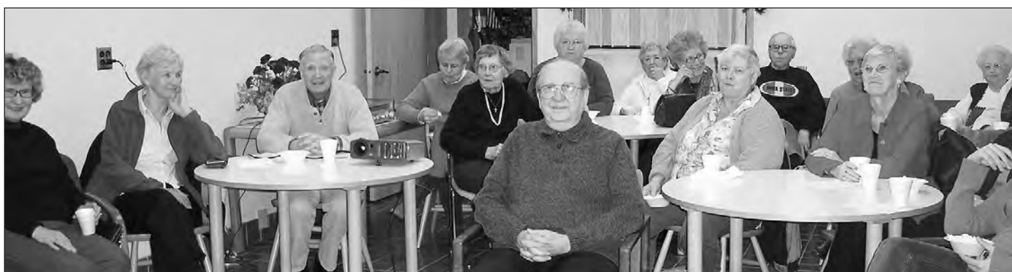
Museum members and guests enjoy a Sunday afternoon matinee of a popular Danish film.