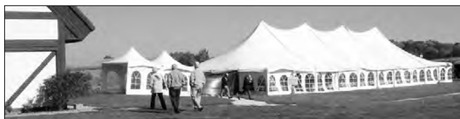
Site of 25th anniversary celebration held on Museum grounds.

provide no product other than preservation and celebration of a cultural heritage. This can provide meaning and understanding and enriches life, but certainly we as individuals have more basic needs for which we must first provide.