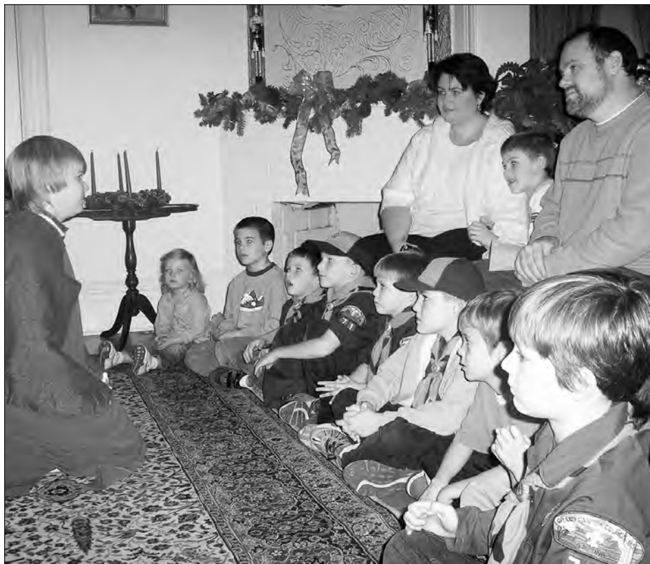
A cub scout troop enjoys the play "The Ugly Duckling" held at the Petersen House Museum in Tempe, Arizona in conjunction with "A Danish Christmas" partnership with The Danish Immigrant Museum.