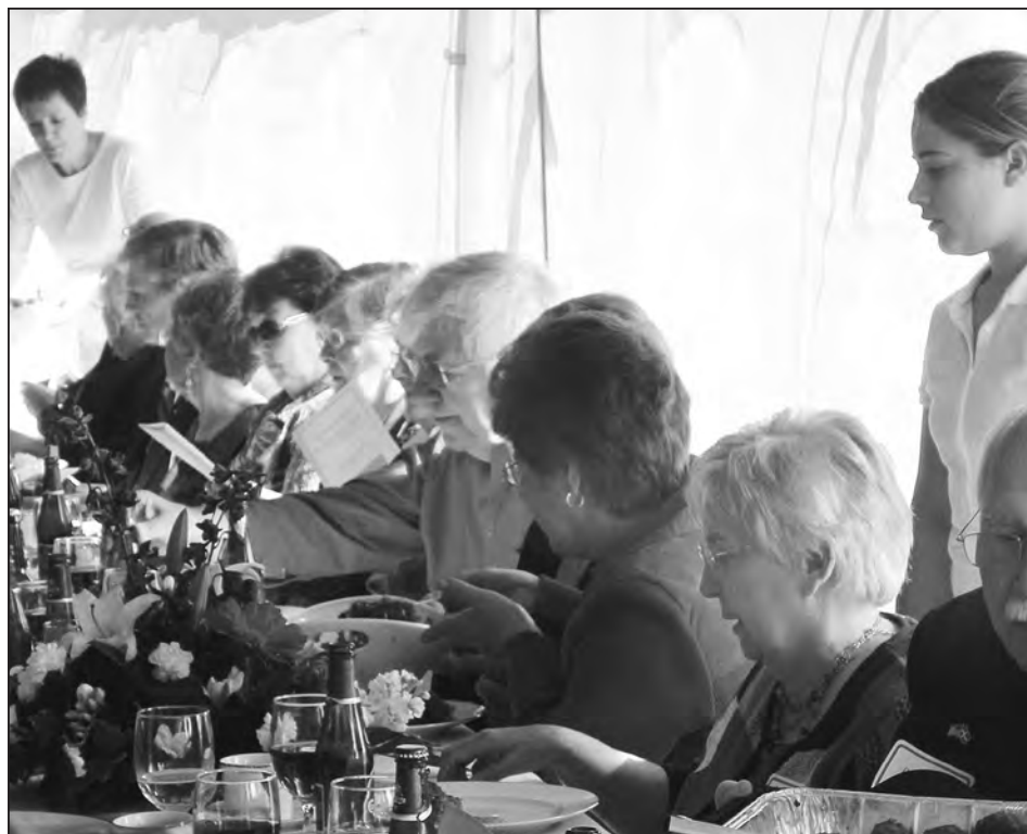
Guests join in singing Danish songs during the anniversary luncheon.