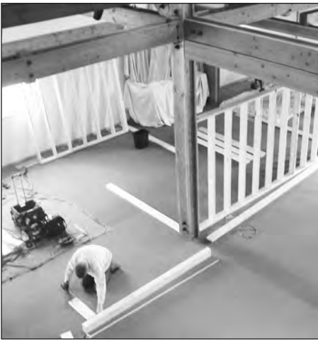
Construction begins on the redesign and update of the Museum's main exhibit, "Across Oceans, Across Time®".