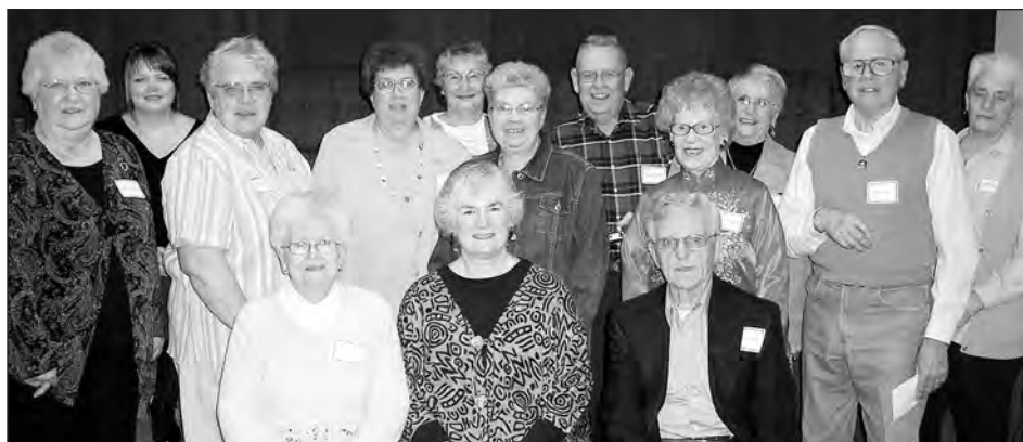
These volunteers of the Family History & Genealogy Center attend the Volunteer Appreciation Banquet.