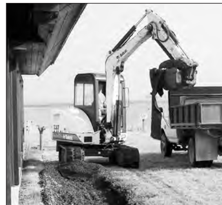
Drainage tile installed to alleviate water problems in lower level.