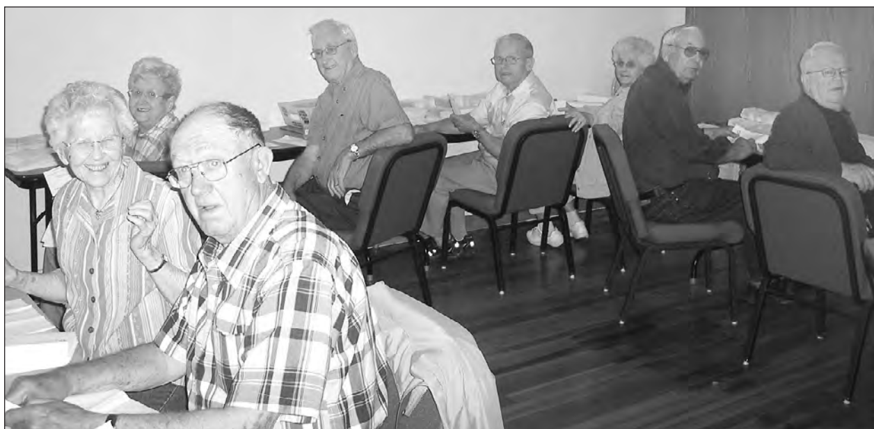
Museum volunteers assist the Development Department by "stuffing" envelopes for the 25th anniversary appeal.