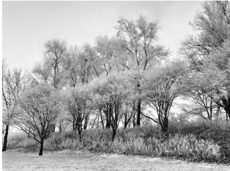
Frost and fog on December 17, 2019.

Every effort has been made to ensure that all information contained in the 2019 Annual Report of Contributions is accurate. We respectfully regret and apologize for any omissions, misspellings, or misplacements. Please contact the Development Department with any questions or corrections.