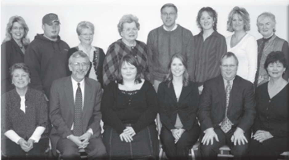
Museum Staff and Interns