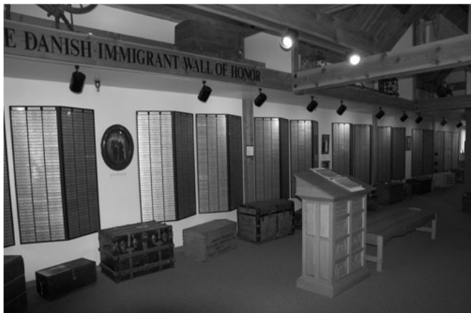
Wall of Honor