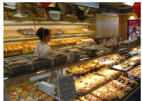
The counter at Kirsten's Danish Bakery was filled with delicious goodies.