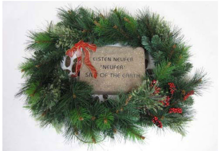
Jens Jensen Heritage Path Brick

Visit the museum's website for more information