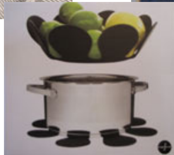
Flexible Silicone Trivet