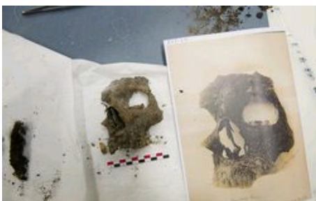
Tycho Brahe's skull beside picture of skull from 1901.

http://www.boingboing.net/2010/11/16/digging-up-the-body.html