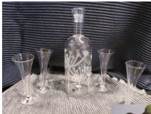
Akvavit decanter and 4 glasses

These items are not featured in our new catalog. Contact Joni for details!