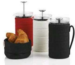
Coffee Press Red or Black available

To order or inquire about these items, call the Museum Shop at 800-759-9192.