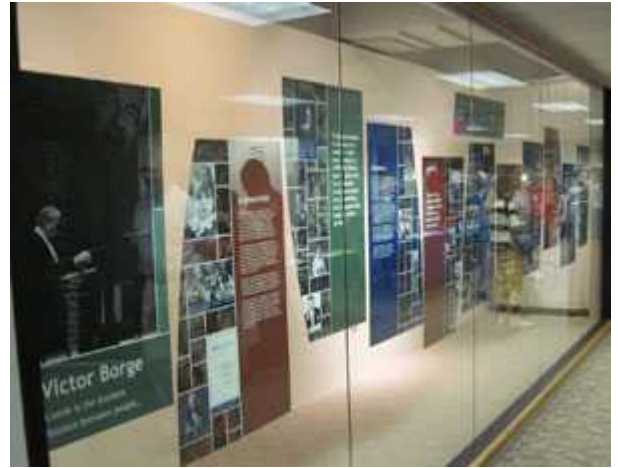
The museum's Victor Borge traveling exhibit in Moorhead