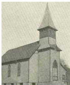
Alden. Founded in 1885.