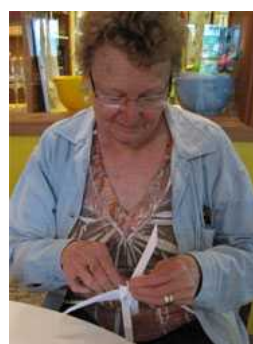
Woven Paper Stars