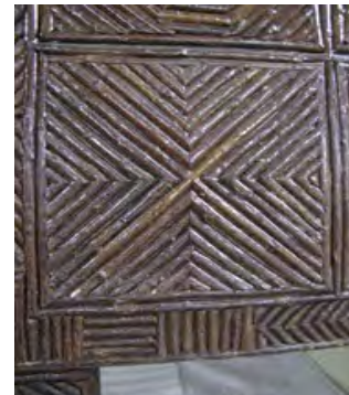
Detail of desk