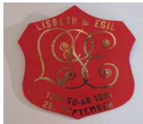
Commemorative shield celebrating the 50 th anniversary of Egil S. Povelsen and Lisbeth Heede of Decorah, Iowa.

Stories and photographs of nearly 50 couples may now be viewed in the Family History & Genealogy Center lobby. The display, which will be up through the end of October, includes immigrant couples married between 50 and 65 years and descendants married for as long as 75 years. Accompanying materials include such varied items as a dress pattern used for a 1934 marriage, a royal license ( kongebrev ) from a 1904 marriage in Denmark, love poetry, and poems and songs written to celebrate couples' 'round' anniversaries.