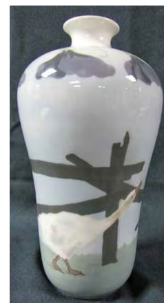
Royal Copenhagen vase