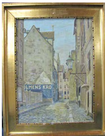
Painting – street scene