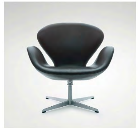
Arne Jacobsen Swan Chair 1957