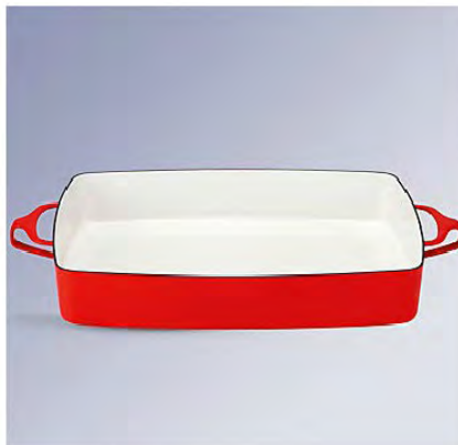
Kobenstyle Baker $90