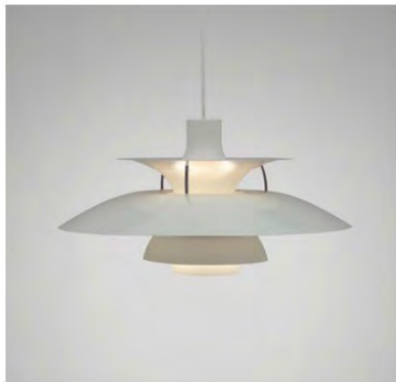
Poul Henningsen Electric lamp, Model PH 5 Plus 1958

The major exhibition for 2013 is a celebration of Danish design from the mid-twentieth century – furniture and housewares that remain popular today. In the years following World War II, a new generation of designers collaborated with furniture makers steeped in a tradition of fine craftsmanship; together they created works of enduring quality and beauty. Many designers became household names in Denmark – Arne Jacobsen, Hans Wegner, Poul Henningsen and others – and many of their pieces are still known by descriptive names that suggest their inspiration – the Artichoke Lamp, the Egg Chair, the Peacock Chair, to name a few. Stay tuned for more details!