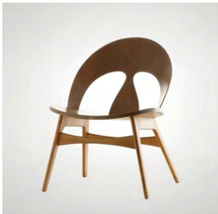
Borge Mogensen "Skalborg" side chair 1949