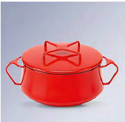
Kobenstyle Casserole with lid $63

Members, don't forget about your Museum Shop discount!