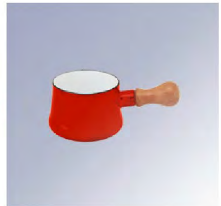
Kobenstyle Butter warmer $36

Call the Museum Shop to inquire about these beautiful and timeless pieces. (800) 759-9198.