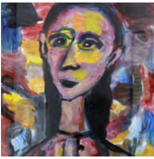
exhibit featuring danish immigrant in dubuque, iowa

Nude Vases, Cubist Faces: Modernism at Rookwood Pottery , an exhibition organized by the Museum of Danish America with guest curator Annemarie Sawkins, Ph.D., is on view at the Dubuque Museum of Art from December 13, 2014 through March 1, 2015.