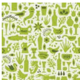
exhibit opening: skål! scandinavian spirits