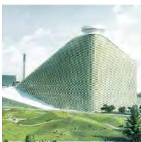
exhibit featuring danish architecture in dc